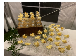
Cheesecake in Martini Glasses

Plain Plain cheesecake will be served by an attendant and placed into a martini glass. Toppings: Graham Cracker Crumbles, Cherry, Strawberry, Blueberry pie filling, Chocolate Syrup, or Salted Caramel.