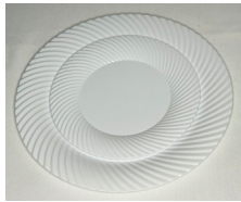
White Plastic Swirl