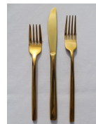
Gold +$1.00 (set) or $.40/piece