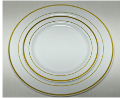
White with Gold Rim