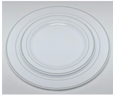
White with Silver Rim