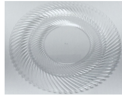
Clear Plastic Swirl