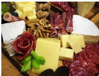
CHARCUTERIE TRAY & CRACKER TRAY - Assorted meats, cheeses, olives, & almonds. (pictured) ($3.50)