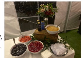
Toppings for Cheesecake

Plain Plain cheesecake will be served by an attendant and placed into a martini glass. Toppings: Graham Cracker Crumbles, Cherry, Strawberry, Blueberry pie filling, Chocolate Syrup, or Salted Caramel.