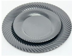
Black Plastic Swirl